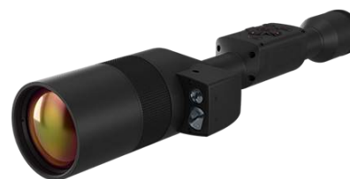
SMART SOLUTION FOR STINGERS