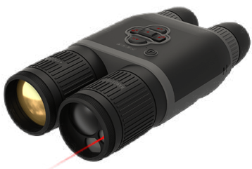
THERMAL SMART HD BINOCULARS W/ BUILT-IN LASER RANGEFINDER