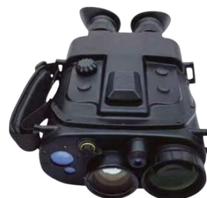
ANTI SNIPER DAY&NIGHT DIGITAL BINOCULAR