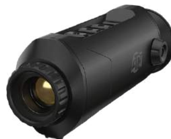
HANDHELD THERMAL MONOCULARS