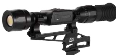
SMART SOLUTION FOR RPG-7