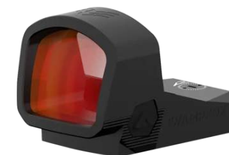
COLLIMATOR REFLECTOR SIGHT