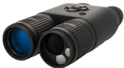
DAY & NIGHT SMART HD BINOCULAR W/ BUILT-IN LASER RANGEFINDER