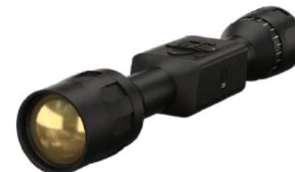
THERMAL RIFLE SCOPES