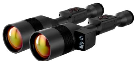
TACTICAL THERMAL WEAPON SIGHT