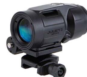
MICRO 3X MAGNIFIER