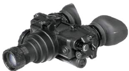
NIGHT VISION GOGGLES