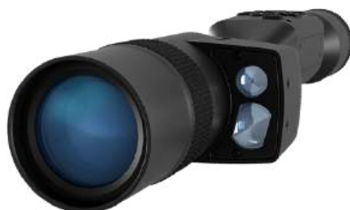
DAYNIGHT WEAPON SIGHT