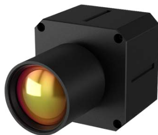
UNIVERSAL THERMAL IMAGING MODULE FOR AVIATION VEHICLES